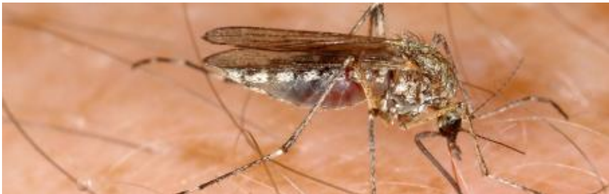
Aedes vexans , which is native to North America, can transmit the Zika virus.

A new study from researchers at the University of North Dakota found that Aedes vexans , a mosquito species indigenous to North America, has the capability to transmit Zika. This is the first native North American mosquito species shown to be able to transmit the virus. Ae. vexans could serve as a potential vector for Zika virus in northern latitudes because of its wide geographical distribution, extreme abundance and aggressive human biting activity. Read more.