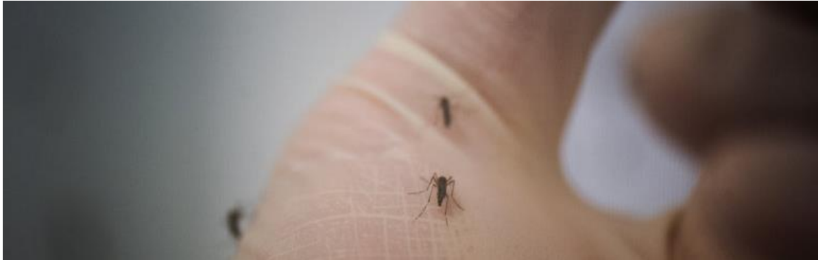
The mosquitoes are back and biting

While we are at the end of the Mosquito season, the Northern hemisphere is just starting. If you are traveling to the USA have a look at this news .