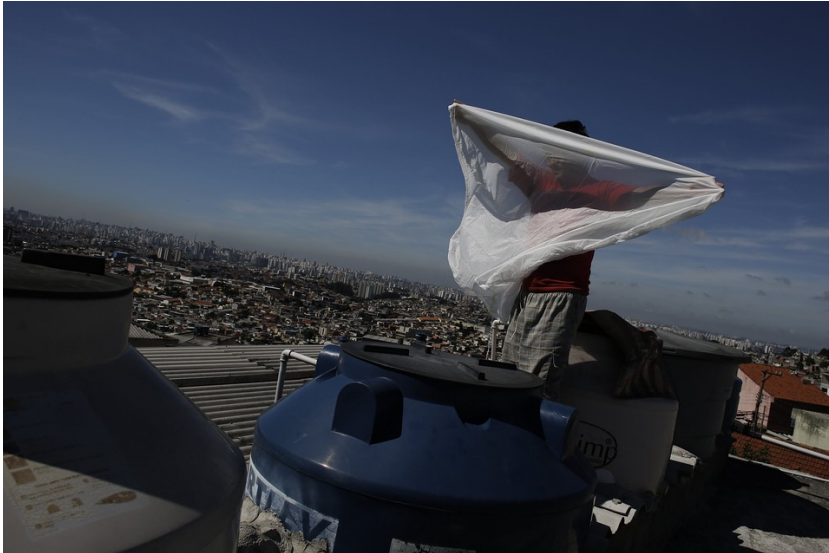
A man holds a mosquito net before placing it over a water container on the roof of his house in Sao Paulo on Feb. 11.