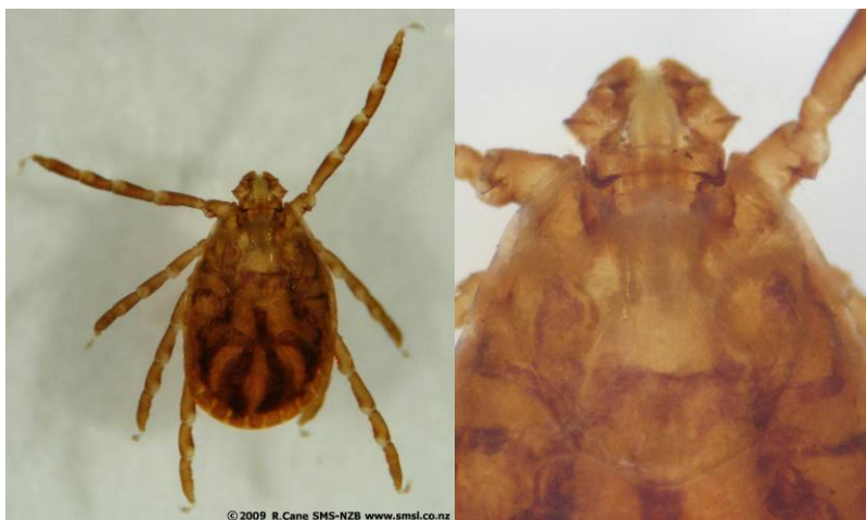
Adult female dorsal view