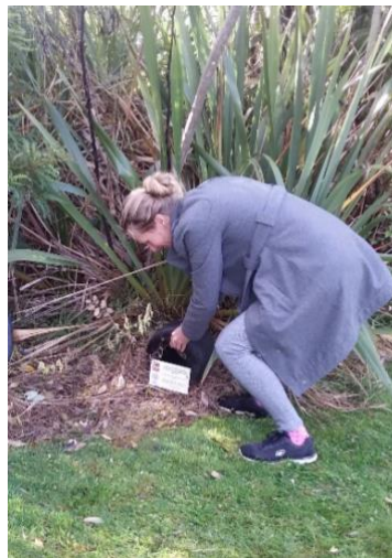
Figure 8) replacing the tyre back where it was found.

Replace the tyre and check the signage is still in place and readable (Figure 8).