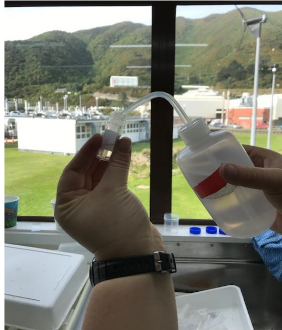
Figure 9a) remove as much water from the tube as possible; b) replacing water with 70% ethanol.