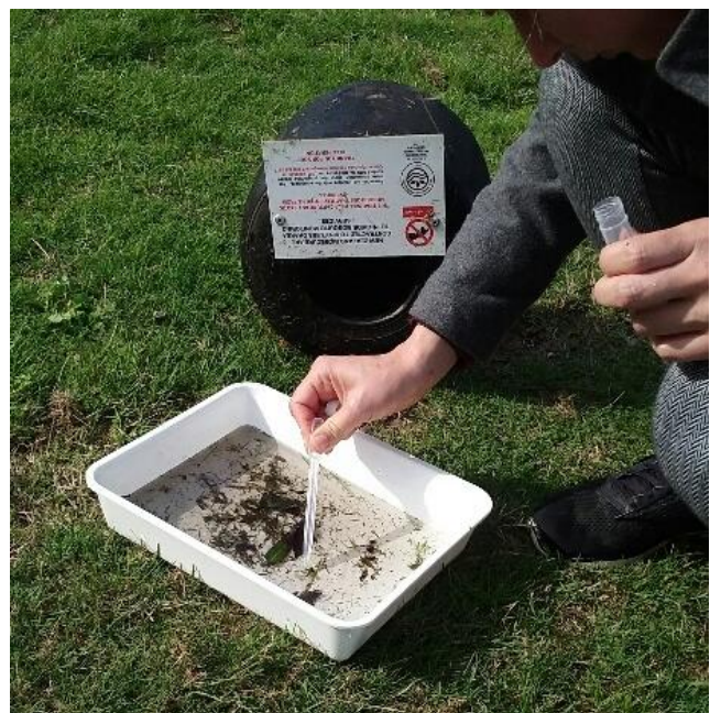
Figure 3) Use a plastic Pasteur pipette to remove larvae from tray.