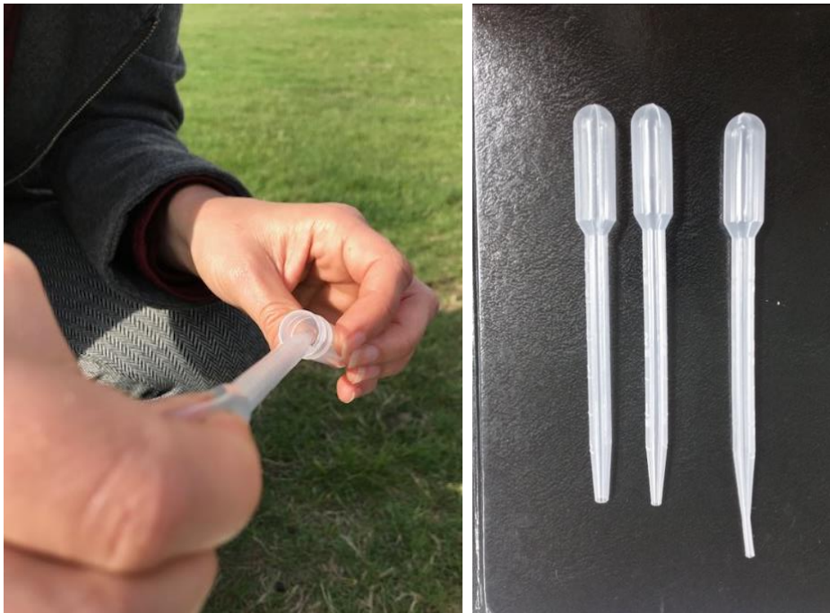
Figure 4a) Larvae are put into a standard sample tube. Removing excess water to allow more larvae to be added to the tube; b) plastic Pasteur pipettes with tips cut to various sizes.

Using a plastic Pasteur pipette, remove all the larvae from the tray into one standard sample tube (Figures 3 and 4). First instar larvae are very small and can be hard to see. It can be useful to look for their shadows on the base of the tray to spot them.