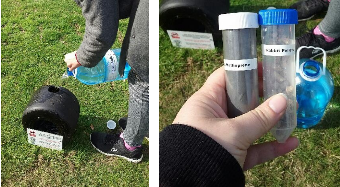
Figure 7a) filling tyre with aged water; b) S-methoprene and rabbit pellets

Replace the tyre and check the signage is still in place and readable (Figure 8).