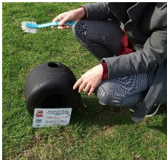
Figure 6) clean out the tyre when dirty.

NB: Do not scrub the tyre if it was negative AND the water is clear.