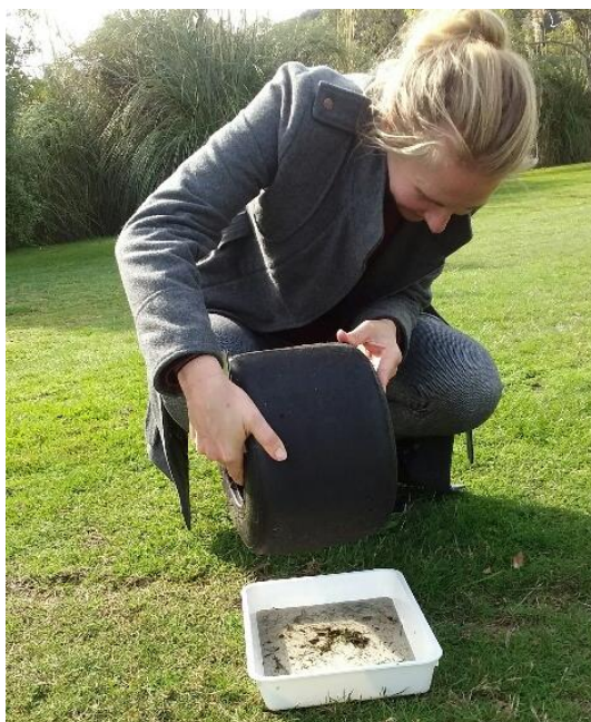
Figure 2) Emptying a tyre trap into a white container.

Pour the entire contents of the tyre trap through the drainage hole of the tyre into a white tray, move your tray into a sunny or well illuminated spot, if there is not enough light use a torch (Figure 2). White trays will make it easier to spot larvae.