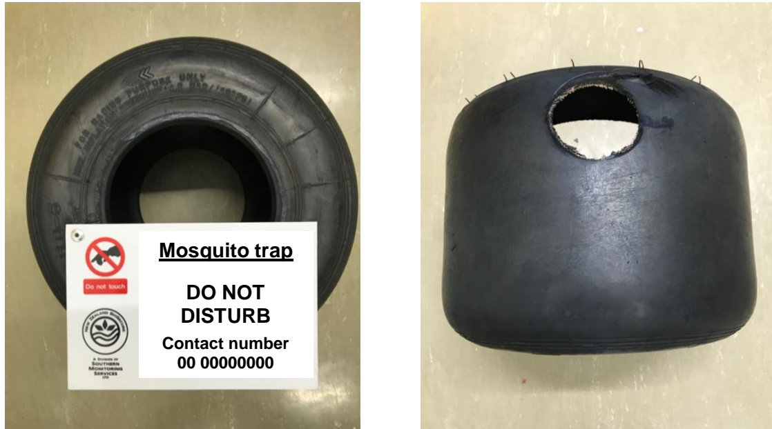
Figure 1a) Tyre trap with signage. b) Hole drilled to empty the content

A tyre trap can be made by using a car, cart or small plane tyre. The tyre must have a hole to allow the contents to be poured in a tray (Figure 1).